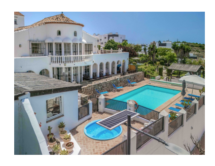
Price: 1,600,000 € Printing day : 14th June 2025

M<sup>2</sup>: 635 Parking places: by request