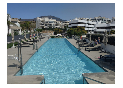
Price: 599,000 € Printing day : 14th June 2025

M<sup>2</sup>: 150 Parking places: by request