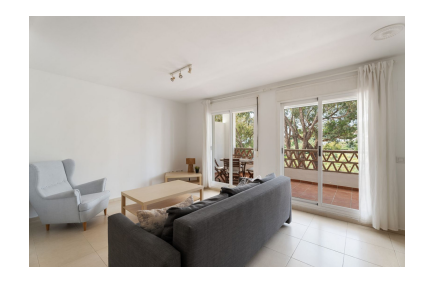
Price: 420,000 € Printing day : 15th September 2025

M<sup>2</sup>: 112 Parking places: by request