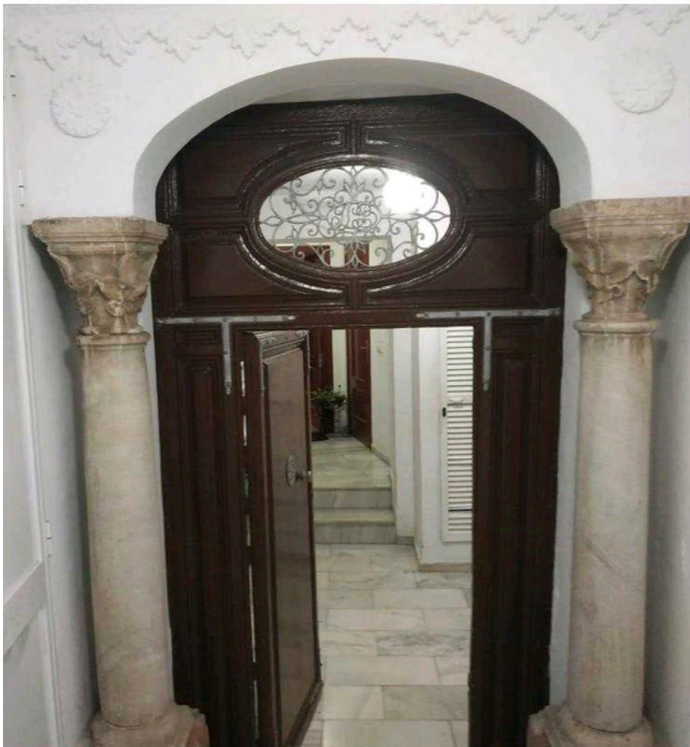
Portal - escaleras