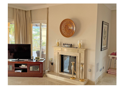
Price: 939,000 € Printing day : 6th June 2025

M<sup>2</sup>: 169 Parking places: by request