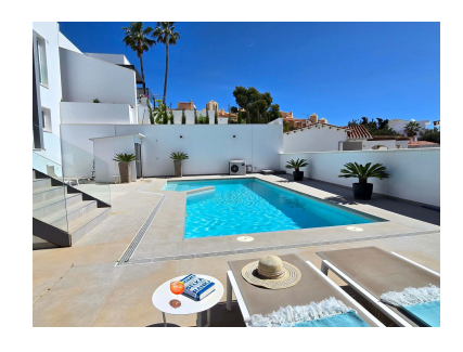
Price: 1,540,000 € Printing day : 17th June 2025

M<sup>2</sup>: 250 Parking places: by request