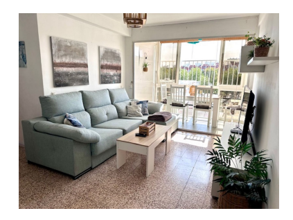
Price: 235,000 € Printing day : 13th June 2025