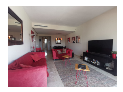
Price: 525,000 € Printing day : 1st September 2025

M<sup>2</sup>: 184 Parking places: by request