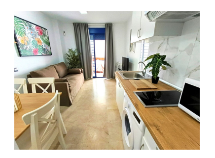
Price: 199,900 € Printing day : 24th February 2025