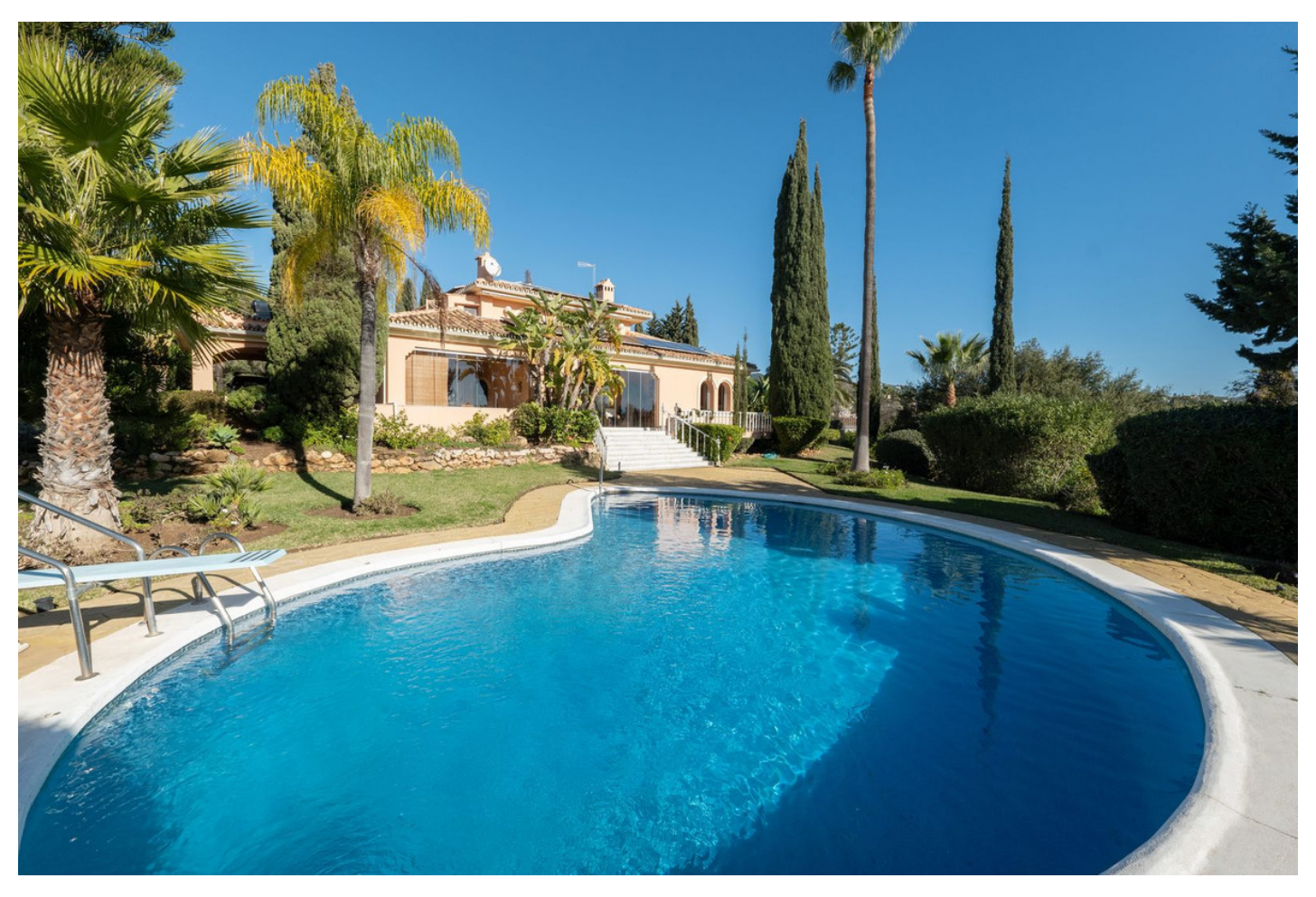
Bedrooms: 3 Status: Sale