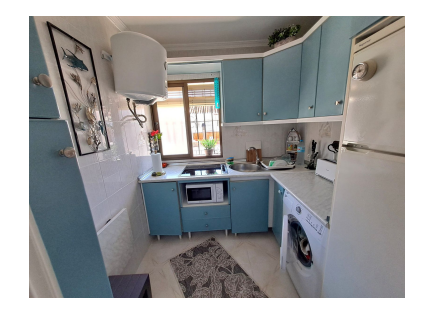
Price: 199,000 € Printing day : 6th February 2025

M<sup>2</sup>: 42 Parking places: by request