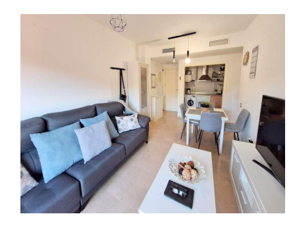
Price: 212,100 € Printing day : 19th January 2025

M<sup>2</sup>: 55 Parking places: by request