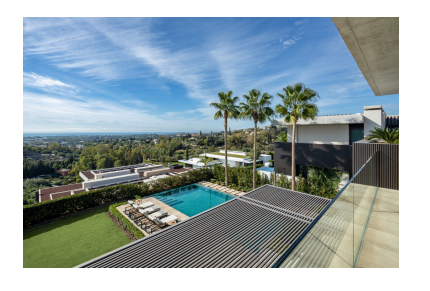
Price: 8,900,000 € Printing day : 12th February 2025

M<sup>2</sup>: 630 Parking places: by request