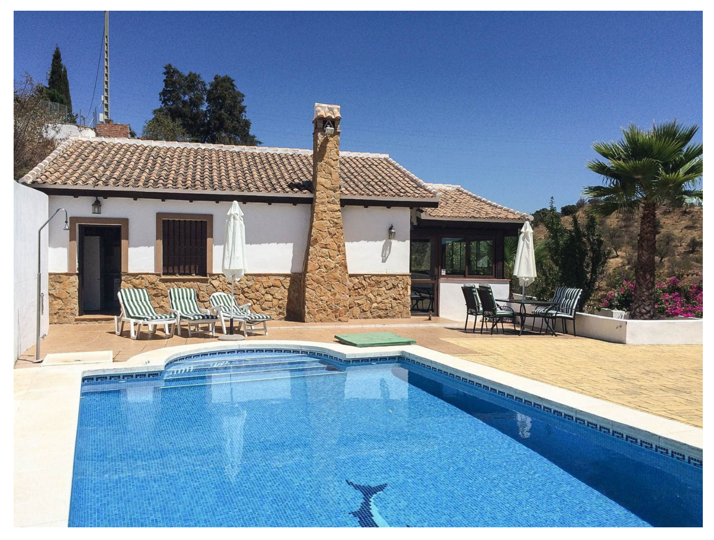
Bedrooms: 2 Status: Sale