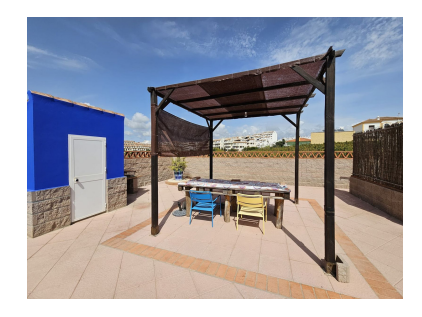
Price: 449,000 € Printing day : 20th January 2025

M<sup>2</sup>: 167 Parking places: by request