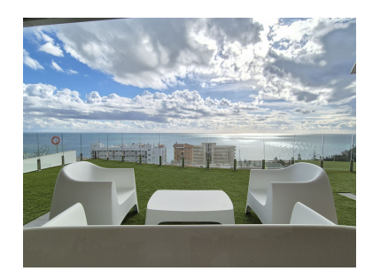
Price: 630,000 € Printing day : 10th May 2025

M<sup>2</sup>: 107 Parking places: by request