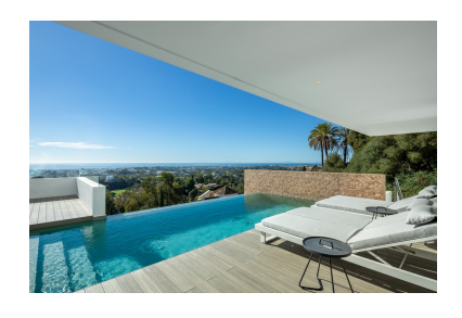
Price: 3,995,000 € Printing day : 28th June 2025

M<sup>2</sup>: 380 Parking places: by request