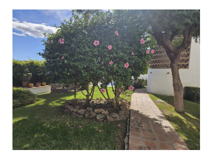
Price: 255,000 € Printing day : 19th January 2025