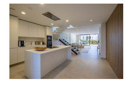
Price: 995,000 € Printing day : 13th September 2025

M<sup>2</sup>: 142 Parking places: by request