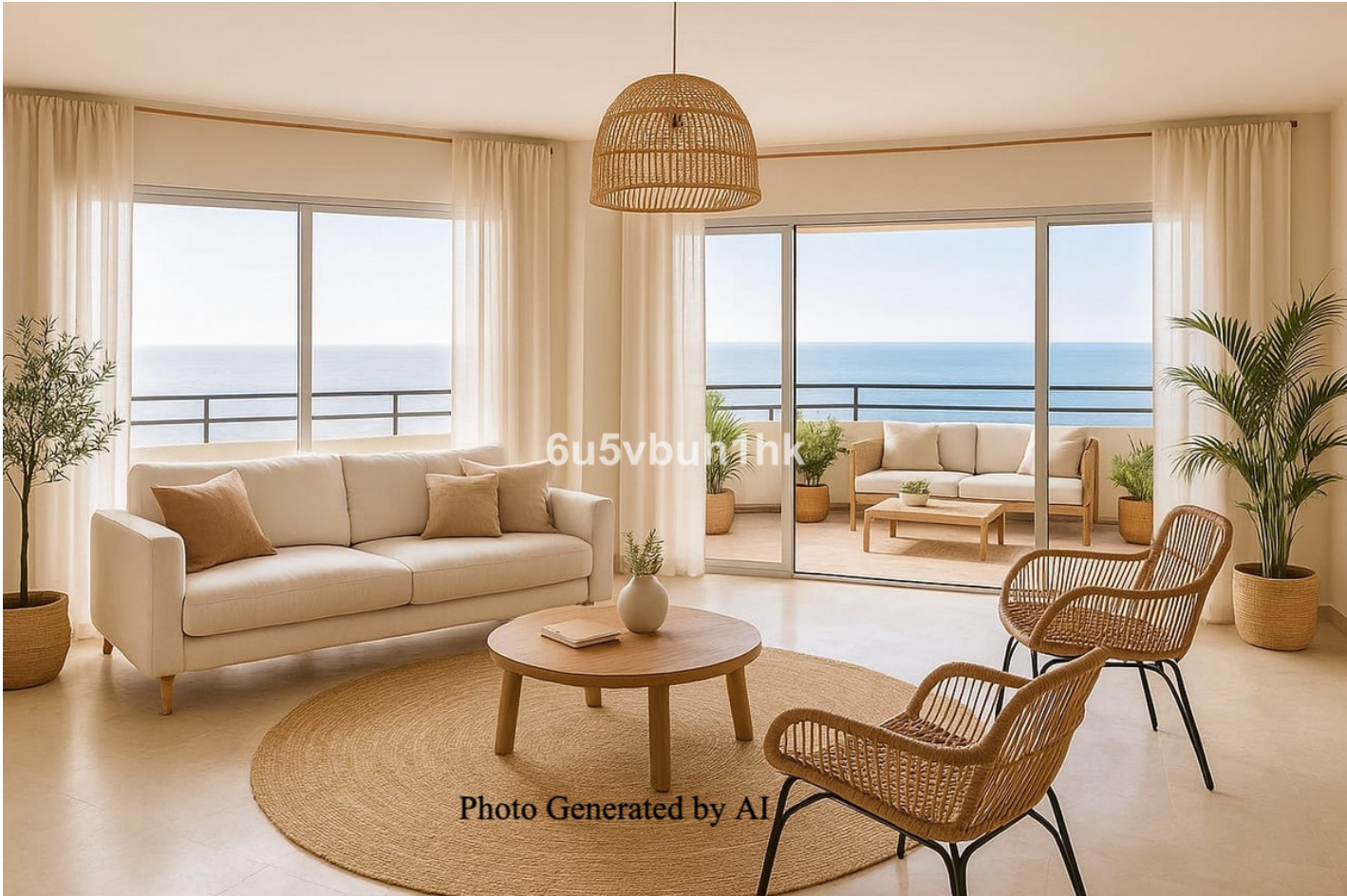
Photo Generated by AI

Bedrooms: 4 Bathrooms: 3 M²: 189 Price: 1,590,000 € Status: Sale Property Type: Apartment Parking places: by request Printing day : 18th September 2025