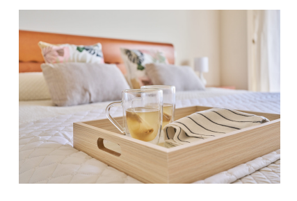
Price: 590,000 € Printing day : 18th October 2024