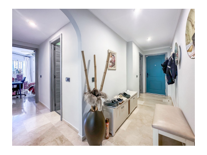
Price: 299,950 € Printing day : 23rd February 2025