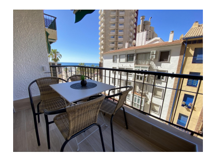
Price: 341,000 € Printing day : 28th June 2025

M<sup>2</sup>: 49 Parking places: by request