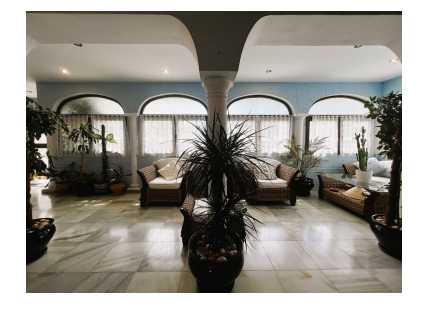
Price: 899,000 € Printing day : 23rd October 2024