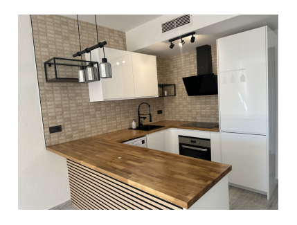
Price: 535,000 € Printing day : 7th February 2025

M<sup>2</sup>: 130 Parking places: by request