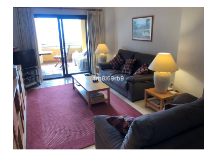
Price: 349,950 € Printing day : 7th February 2025