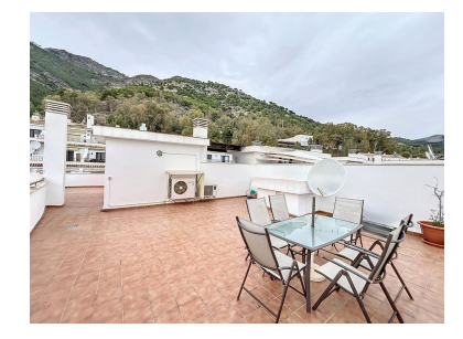
Price: 285,000 € Printing day : 20th January 2025