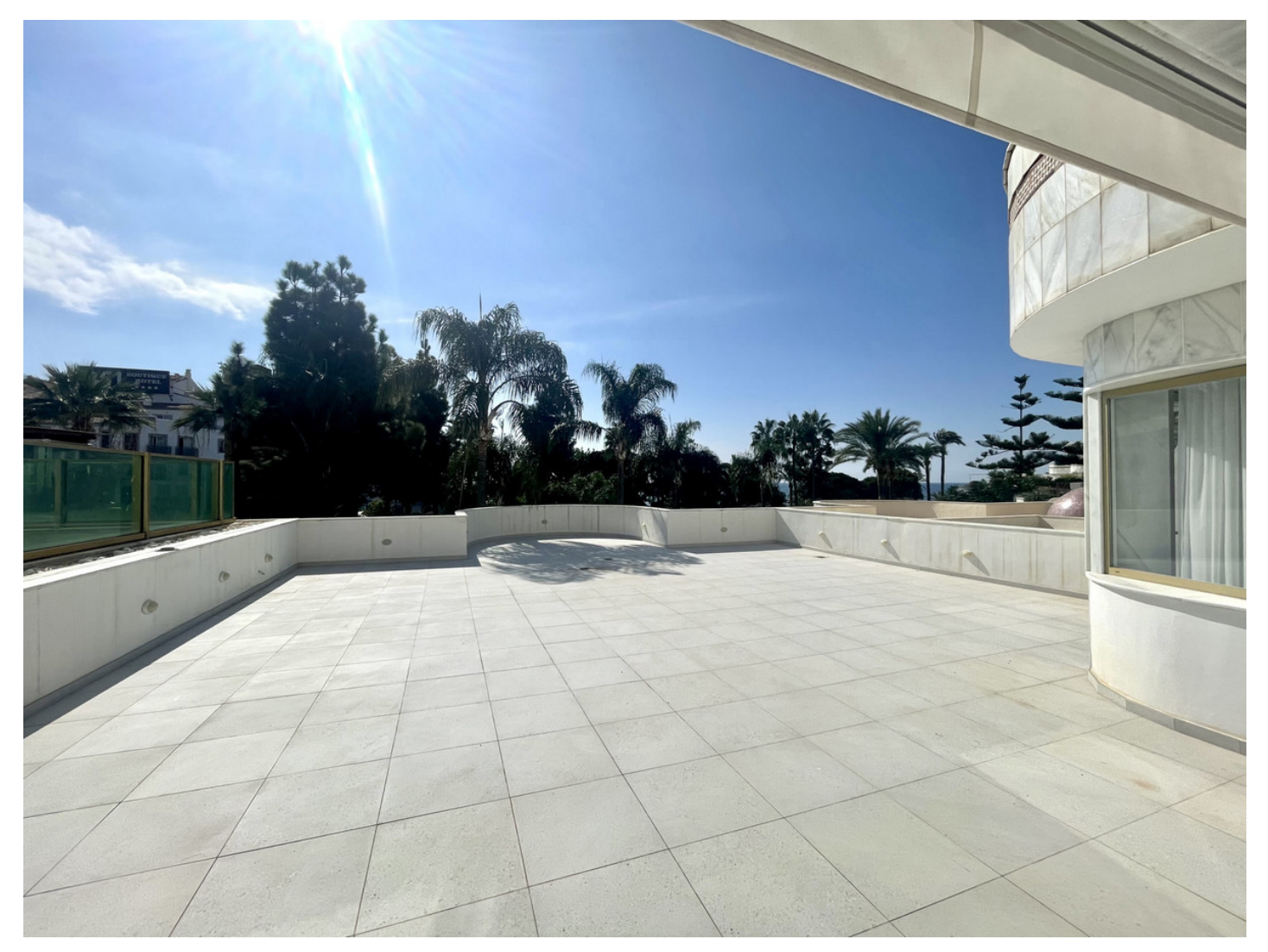
Bedrooms: 3 Status: Sale

Bathrooms: by request Property Type: Apartment