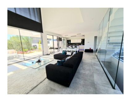
Price: 2,500,000 € Printing day : 11th June 2025

M<sup>2</sup>: 571 Parking places: by request